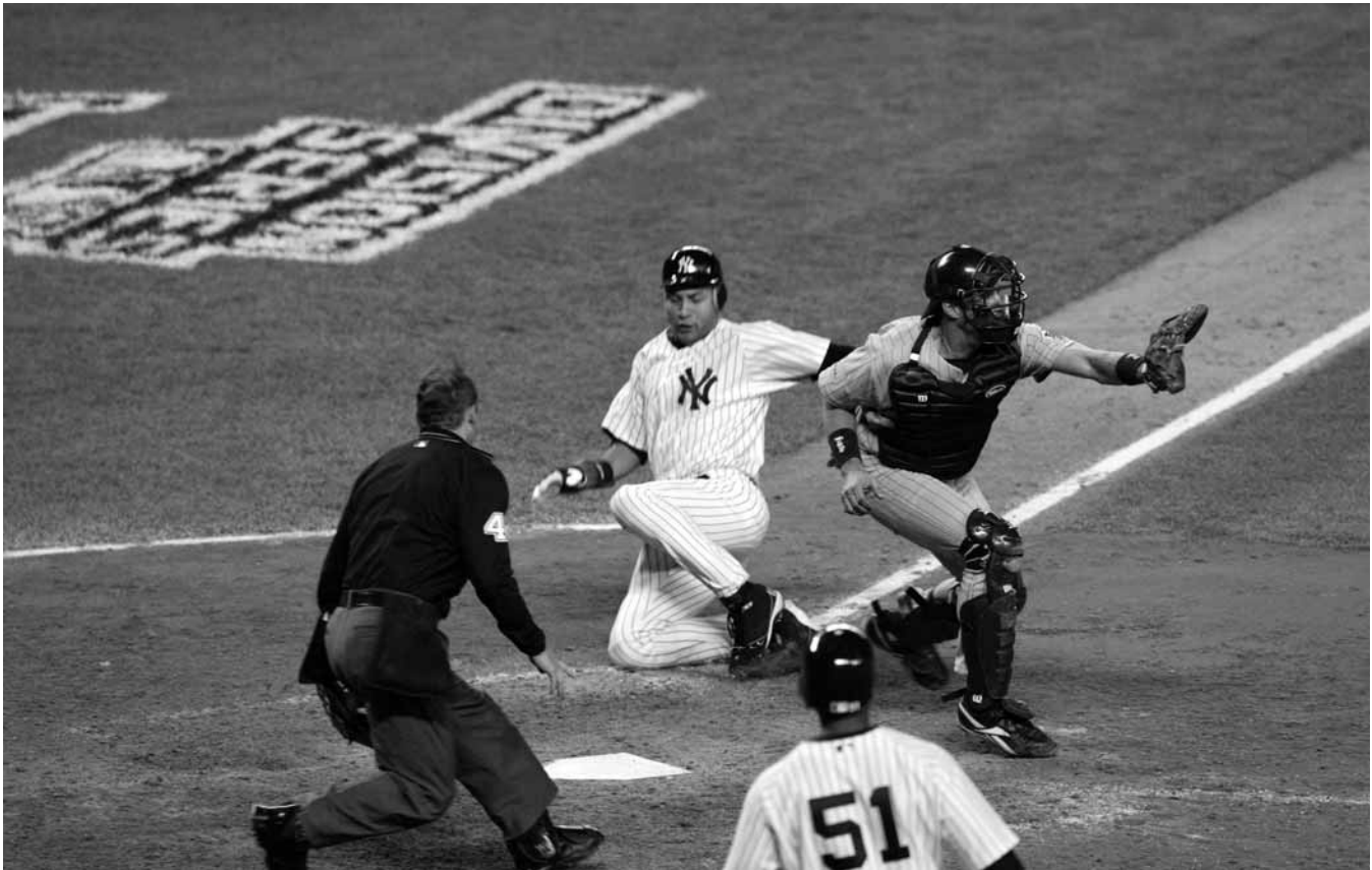
Yankee Derek Jeter slides past Red Sox catcher Jason Varitek as Bernie Williams watches, 2004 American League Championship Series.